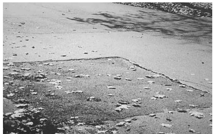
Figure 7. Pavement damage from settlement and shrinkage of cold patch asphalt.

All repairs in London with concrete pavers and low-density concrete have produced a smooth surface transition from the asphalt to the pavers. The riding