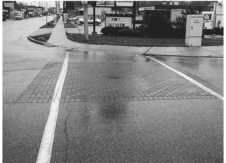
Figure 13. Concrete pavers in utility cuts can be painted as any other pavement.

ments of ASTM C 144 (11) or CSA A179 (10). The joints must be completely full of sand after compaction. Remove excess sand and other debris. The pavers may be painted with the same lane, traffic, or crosswalk markings as any other concrete pavements (Figure 13).