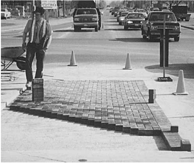
Figure 12. Pavers are laid in a 90 degree herringbone pattern between the border courses.