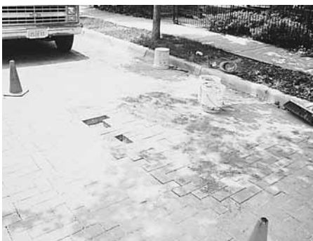
Figure 4. Reinstatement of the pavers, bedding and joint sand.