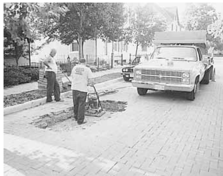
Figure 3. Compaction of the base.