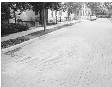
Figure 5. The final paver surface is continuous. There are no cuts or damage to the pavement.