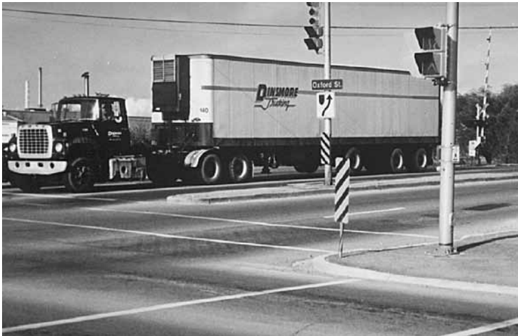
Figure 10. A patch of barely discernable pavers in a heavily trafficked intersection in London, Ontario.

A strength of 10 psi (0.07 Mpa) should be achieved within 24 hours. The maximum 28 day compressive strength should not exceed 50 psi (0.4 Mpa) as measured by ASTM C 39 (11) or CAN3-A23.2-9C (10). Cement content should be no greater than 42 lbs/cy (25 kg/m 3 ). The low maximum cement content and strength enables the material to be excavated in the