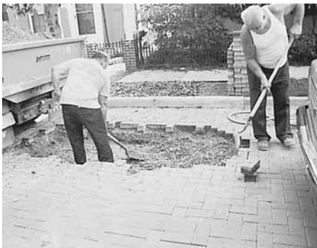
Figure 2. Removal of concrete pavers for a gas line repair in Dayton, Ohio.

User costs due to traffic interruptions and delays are reduced because concrete pavers require no curing. They can handle traffic immediately after reinstatement, reducing user delays. Furthermore, reinstated concrete pavers preserve the aesthetics of the street or sidewalk surface. There are no patches to detract from the character of the neighborhood, business district, or center city area. With many projects, concrete pavers help define the character of these areas. Character influences property values taxes. Attractive paver streets and walks without ugly patches can positively affect this character.