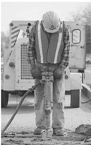
Figure 1. Repairs to utilities are a common sight in cities, incurring costs to cities and taxpayers.

A 1985 study in Burlington, Vermont, demonstrated that pavements with patches from utility cuts required resurfacing more often than streets without patches. Pavement life was shortened by factors ranging between 1.70 and 2.53, or 41% to 60% (2). Research in Santa Monica, California, showed that streets with utility cuts saw an average decrease in life by a factor of 2.75, or 64% (3). A 1994 study by the City of