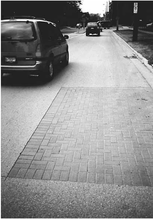
Figure 8. Utility cut repair in a residential area in London, Ontario.

quality and safety has improved to the extent that the transition from one surface to the next can barely be discerned by the driver. The pavers were colored to match the appearance of the asphalt so there would be no substantial differences in appearance. Figure 10 shows such a patch of pavers blending with the surrounding pavement.