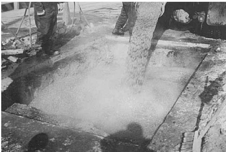
Figure 11. Low density concrete fill (unshrinkable fill) poured into a utility trench from a ready-mix concrete truck.

future. Mixes containing supplementary cementing materials should be evaluated for excessive strength after 28 days.